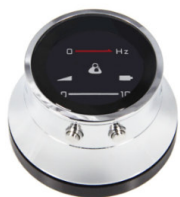
Thinklabs One Digital Stethoscopes