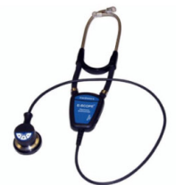
Cardionics The Heart of Association E-Scope

Here are some models of amplified stethoscopes discussed in the Association of Medical Professionals with Hearing Loss (AMPHL) comparison table.