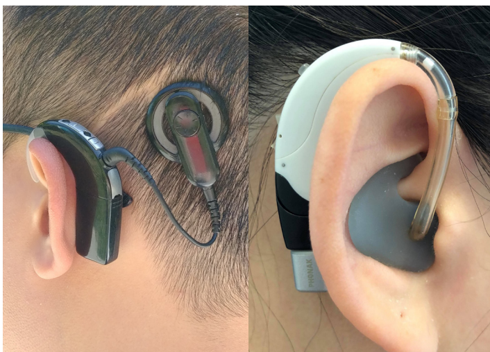
On the left is a cochlear implant and on the right is a hearing aid.

There is an option to borrow (for free) ALDs from Assistive Technology BC (ATBC). This can be a good option if you want to experiment using ALDs and do not want to commit to buying them right away. Your accessibility advisor can assist you with this application.